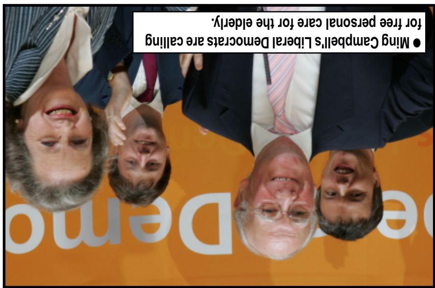
● Ming Campbell's Liberal Democrats are calling for free personal care for the elderly.

Most local people want a more caring approach to caring for Hinckley's elderly residents from both the New Labour Government and the Conservative Councils. 82% say they think students and the elderly should get cheaper bus fares. We are dismayed that it took the Tories who run both the County and Borough Councils so long to sort out the concessionary fares muddle.