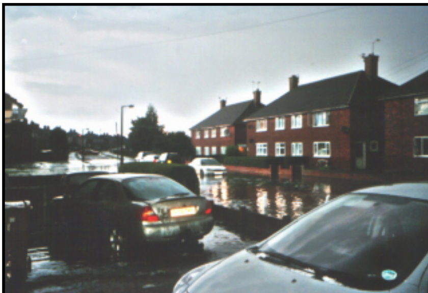
● Scenes like this are common in many parts of Burbage, causing misery to local residents. Liberal Democrats are taking up flooding problems across the area.

A group including the Borough Council, Severn Trent, the Environment Agency and the County Highways was set up following the severe floods last year. This Group has yet to report to the residents affected, but we understand that blockages were found in the pipes under Brookside, Featherston Drive and Holt Road and that these have been cleared. It is essential that the drainage system is inspected regularly and that residents are kept informed. We shall continue to demand measures to alleviate floods including the possibilities of small lagoons, grids at culvert entrances and clearance of an area of the flood relief basin between Brookside and East Close.