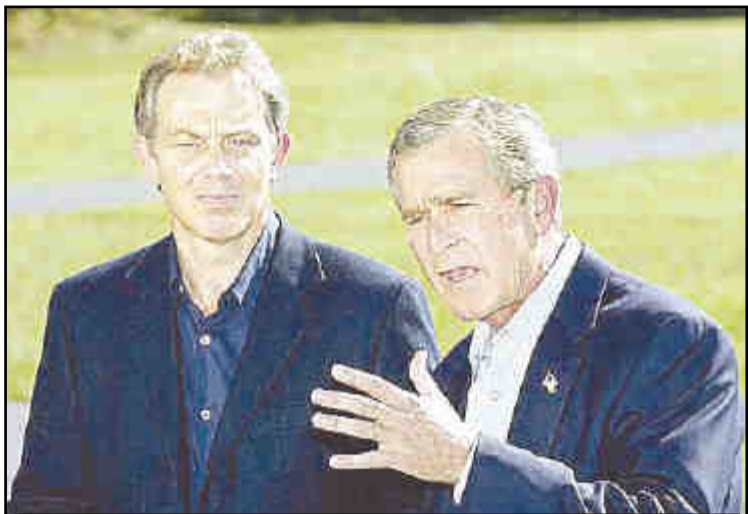
Ten years in power and Labour has let Britain down. On May 3rd you can send Tony Blair a message he cannot ignore!

It's been TEN years since New Labour came to power and they have disappointed many people.